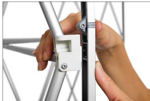
Simply install the durable magnetic bars to the frame.