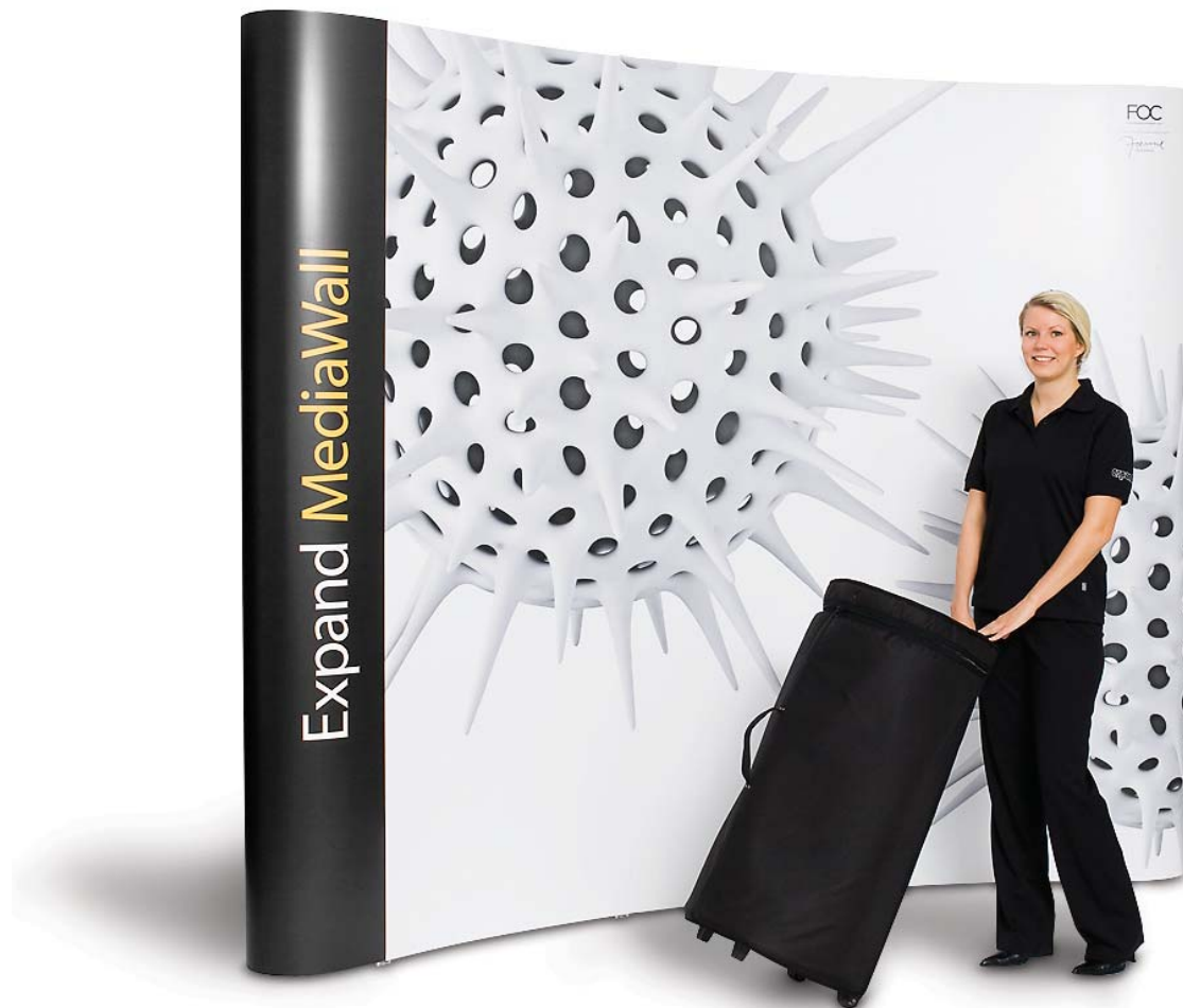
The Expand MediaWall is easy to transport in the padded, nylon bag with wheels.