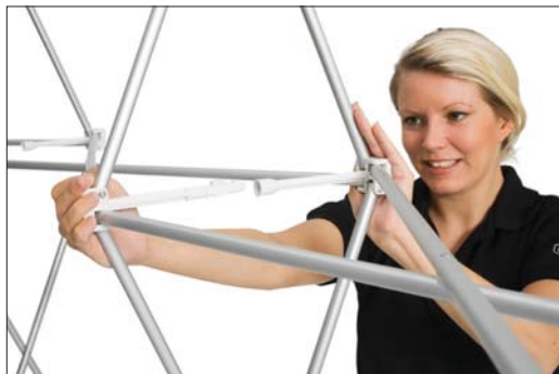
Easily attach the locking connectors on the Expand MediaWall.