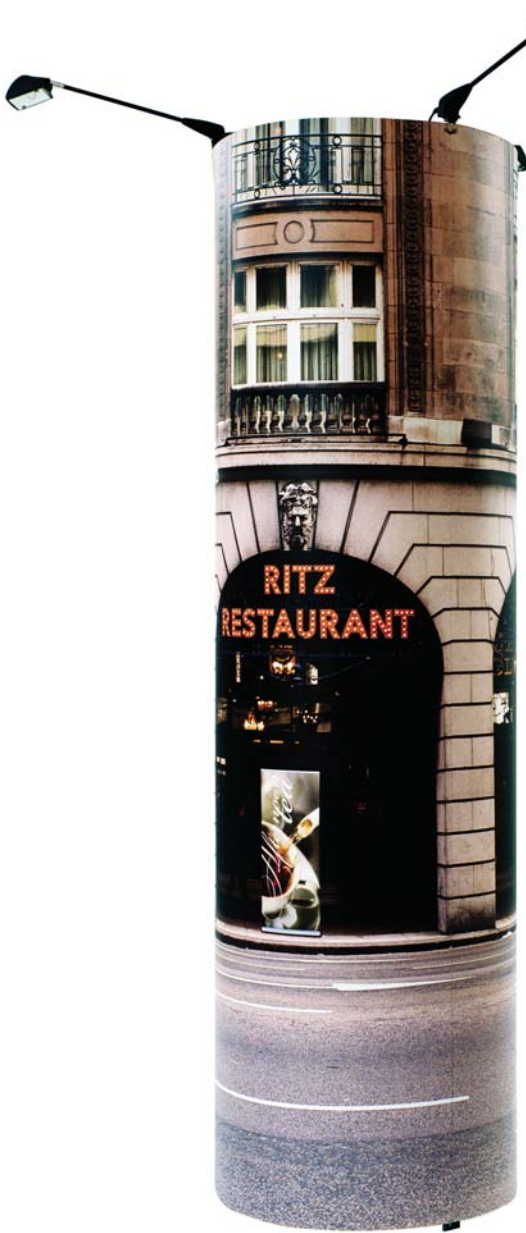
3 Square High Expand Tower shown above with optional spotlights and a printed InkJet graphic. 26" Wide Diameter x 88" High