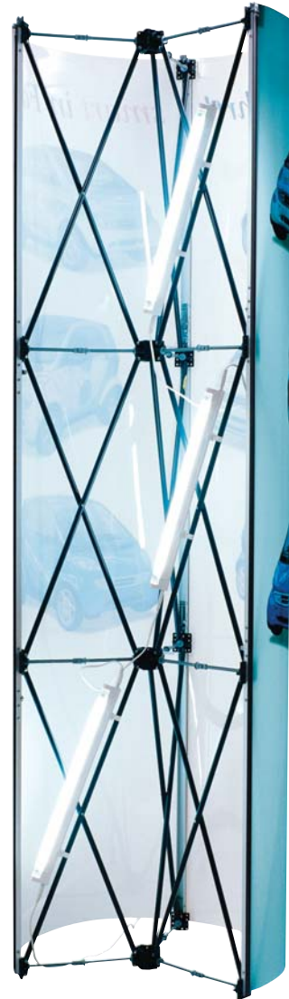
An inside look at the hardware and internal lighting system with one graphic panel removed.