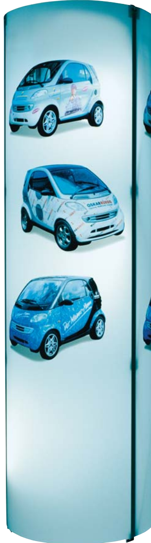
3 Square High Expand Tower shown above with optional florescent lights and Printed Graphic on Backlit material. 26" Wide Diameter x 88" High