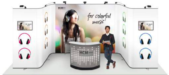
Open U shape