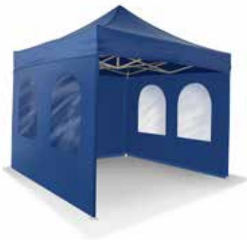
3 x 3 m