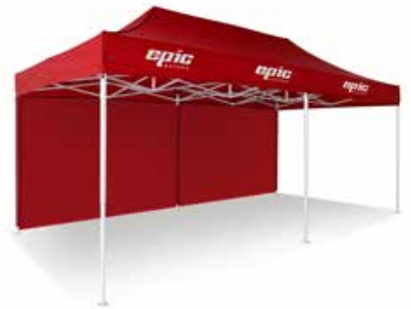
6 x 3 m

High quality tents – stable and easy to set up