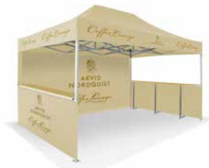
4,5 x 3 m