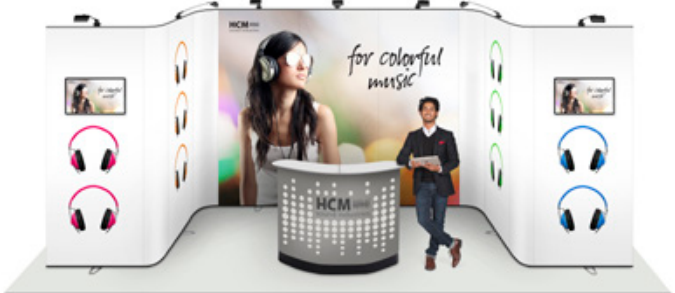
Open U shape