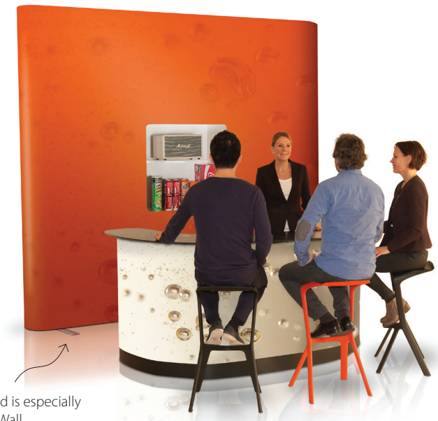
Support feet are available for extra stability and is especially recommended for the straight Expand MediaWall.